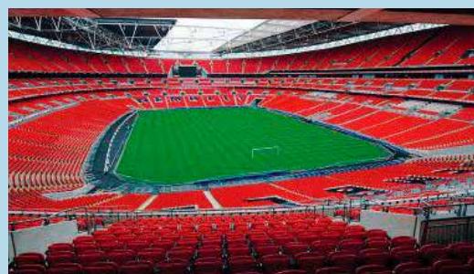
Wembley Stadium: The largest stadium in the UK, showing English football & live concerts.