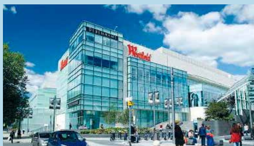
Westfield Shopping Centre: Luxurious brands & fashion outlets in Shepherd's Bush.