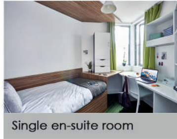
Single en-suite room