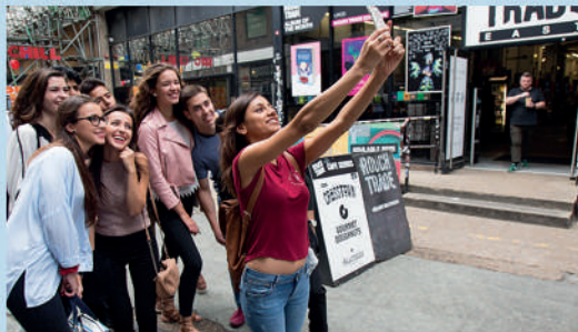
Shoreditch: View the lovely stalls in Brick Lane Market