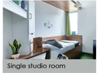
Single studio room