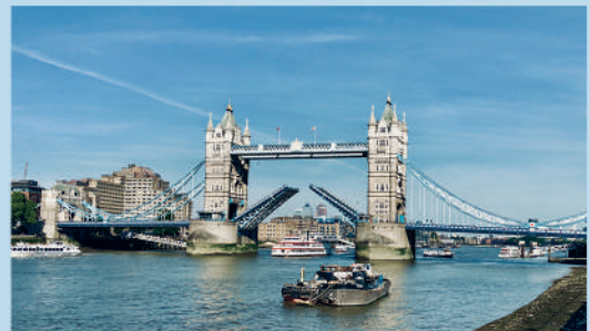
Tower Bridge: Take a selfie on this beautiful landmark, just minutes away from The Curve