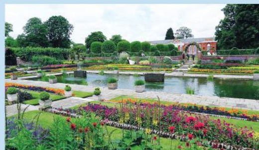
Kensington Gardens: Take a stroll in one of London's gardens