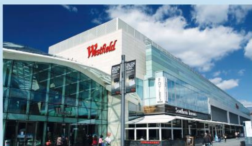
Westfield Shopping Centre: Paradise for shopaholics - local fashion outlets