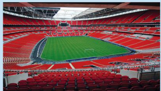
Wembley Stadium: The largest stadium in the UK, showing English football & live concerts