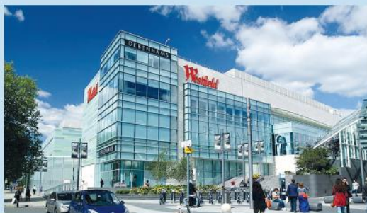
Westfield Shopping Centre: Luxurious brands & fashion outlets in Shepherd's Bush