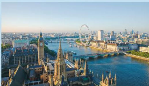
Westminster: Discover London's most iconic landmarks in just a 20-minute walk