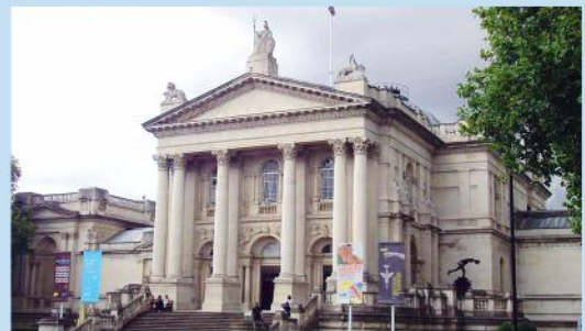
Tate Britain: Visit historic British Art dating back to the 1500s