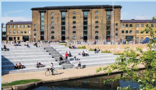
Granary Square: Canal-side the heart of King's Cross, with local bars & restaurants