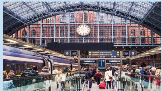
St. Pancras International: Travel to Paris or Brussels from the Eurostar in St. Pancras